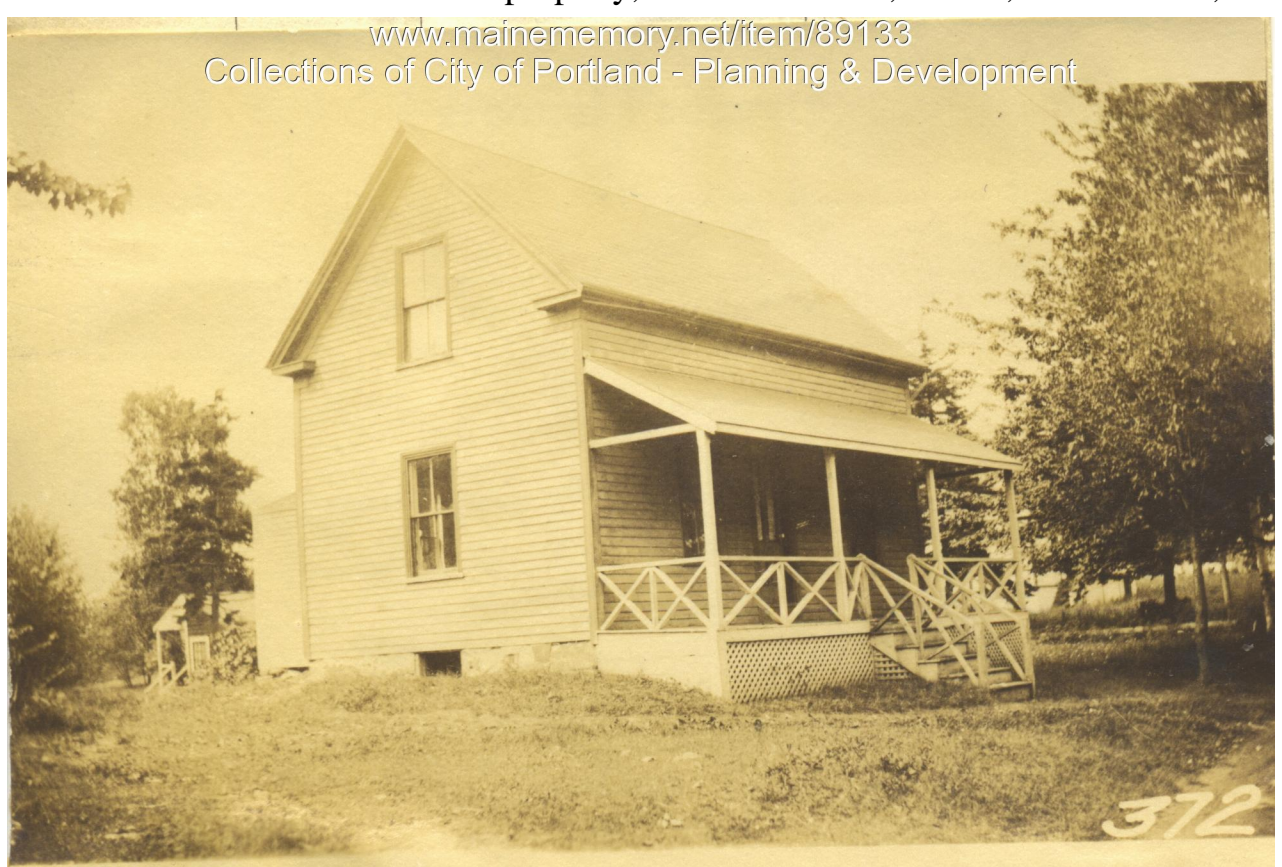
1924 Portland Tax Records: Anderson property, S. Side A Street, Lot 22, Peaks Island, Portland, 1924