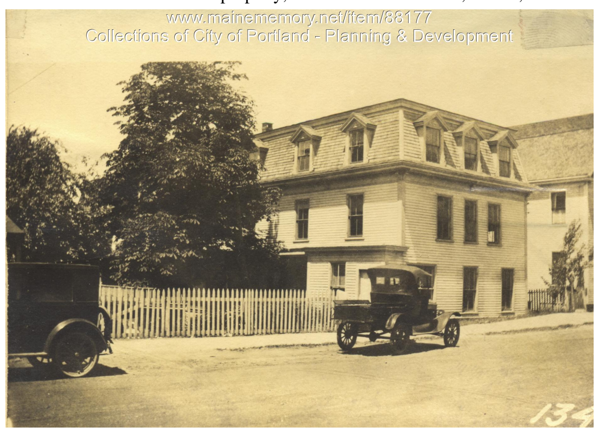
1924 Portland Tax Records: Howard property, W. Side Island Avenue, Lot 28, Peaks Island, Portland,