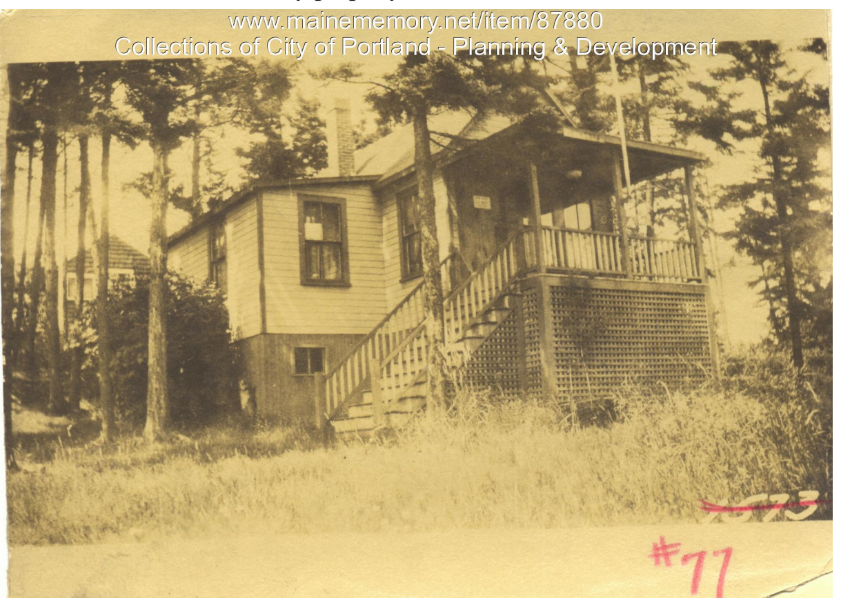
1924 Portland Tax Records: Sweeney property, N. Side Island Avenue, Lot 112, Peaks Island, Portland