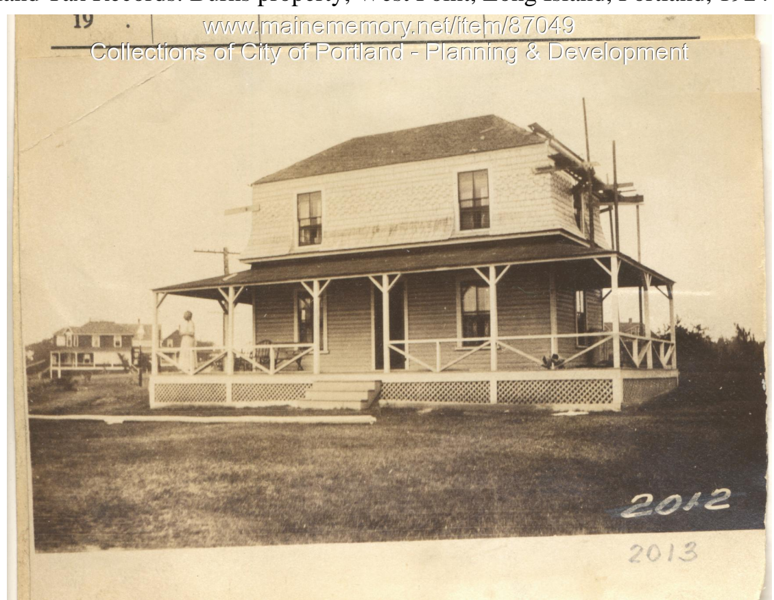
1924 Portland Tax Records: Burns property, West Point, Long Island, Portland, 1924