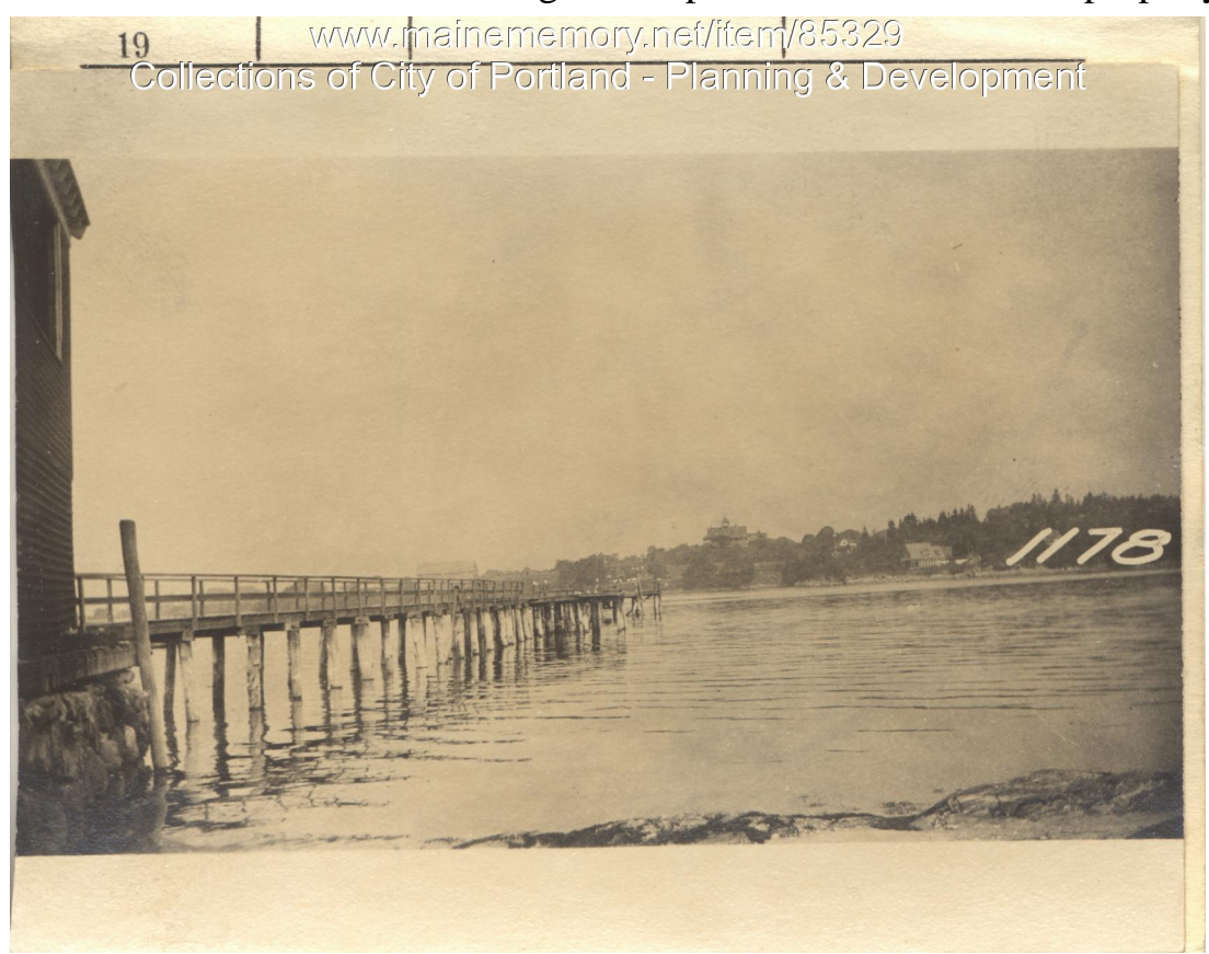
1924 Portland Tax Records: Trefethen-Evergreen Improvement Association property, Trefethen's Lan

Owner: Trefethen-Evergreen Improvement Association