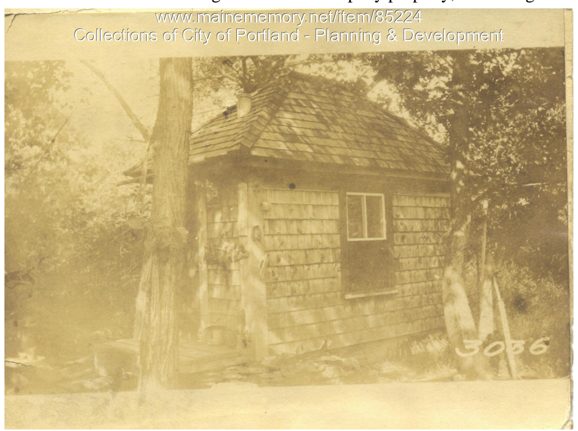
1924 Portland Tax Records: Island Light and Wter Company property, Island Light and Water Co. She