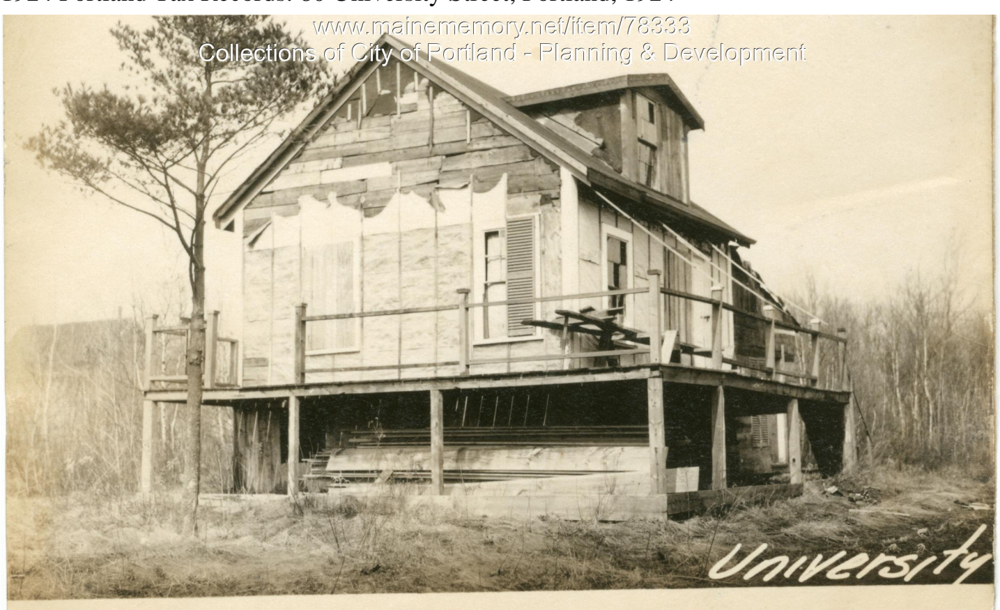
1924 Portland Tax Records: 80 University Street, Portland, 1924