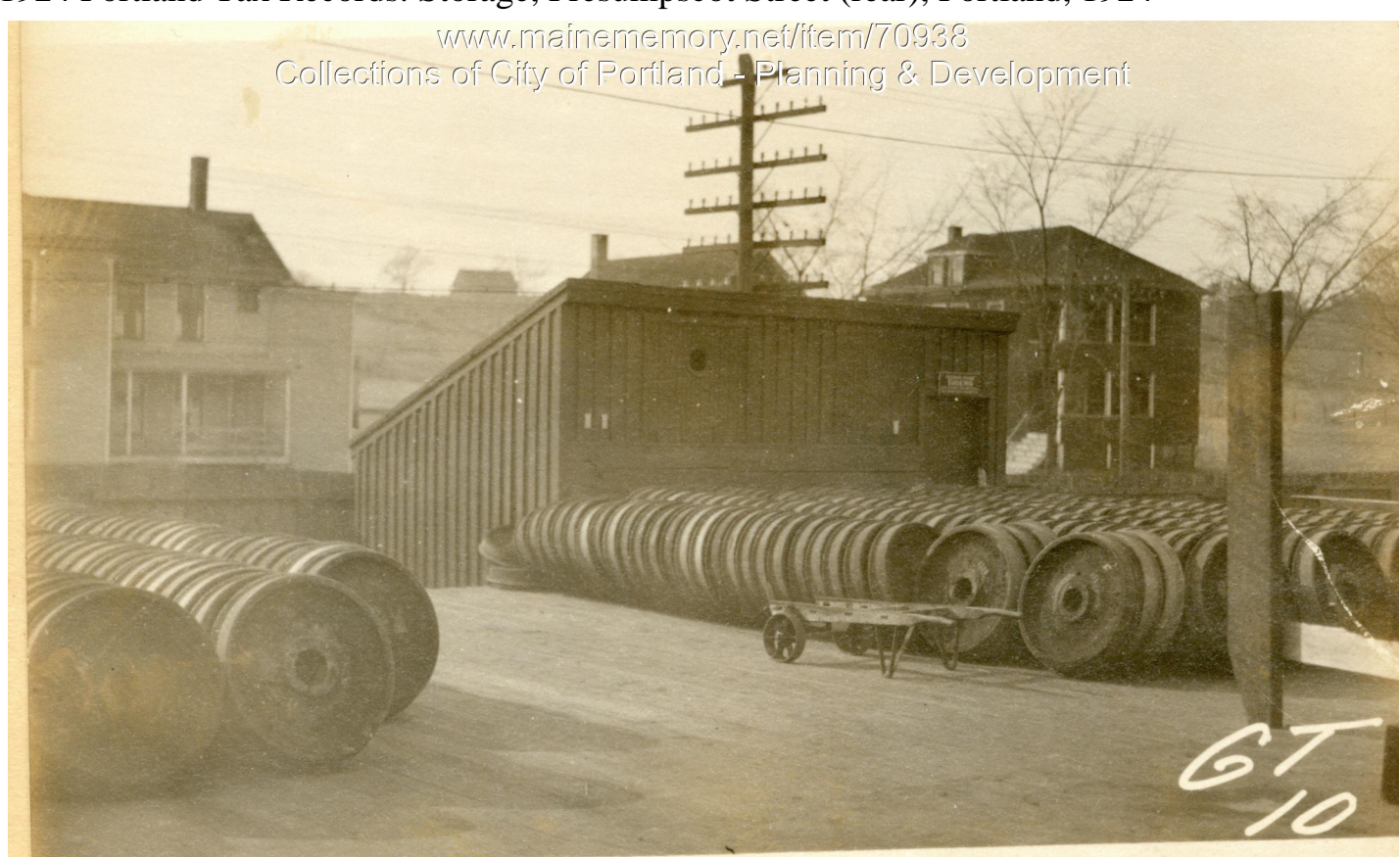
1924 Portland Tax Records: Storage, Presumpscot Street (rear), Portland, 1924