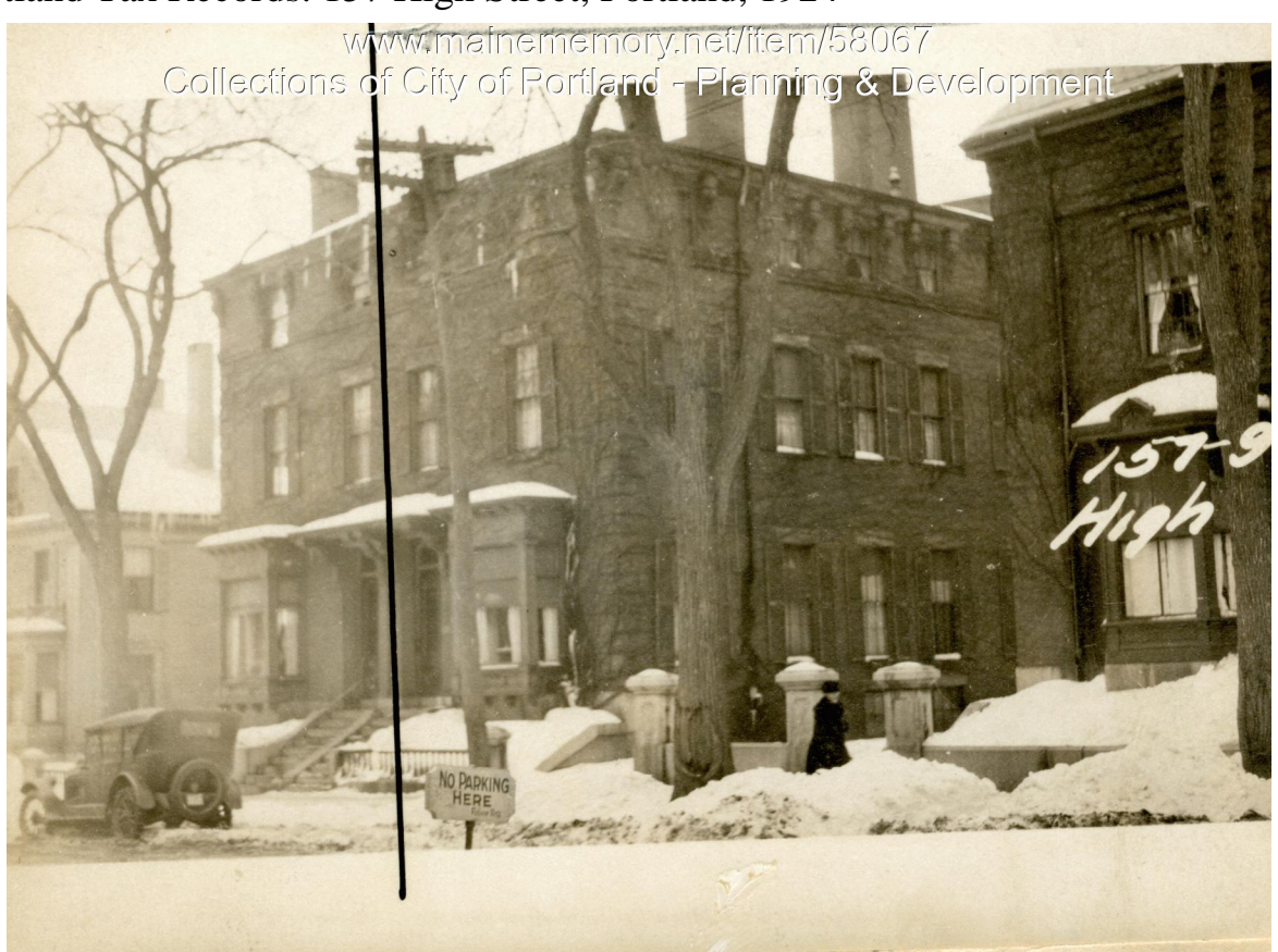
1924 Portland Tax Records: 157 High Street, Portland, 1924